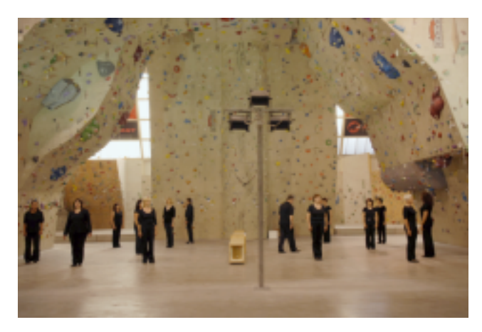
Figure 4 . Improvisation Concert for Choir and Organ Pipe, Linz, 2009

Capital at the time. The members of a women's ensemble improvised to the accompaniment of the Interactive Infrasonic Environment. With certain sequences of movements, members of the choir could steer the tones produced by the organ pipe. The tones generated by the organ pipe in turn provided the impetus for tonal variations in the choir's singing.